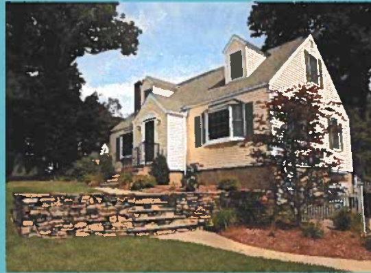
RETAINING WALL W/STAIRS