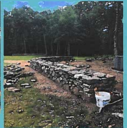
STONE FENCE / FREE STANDING WALL